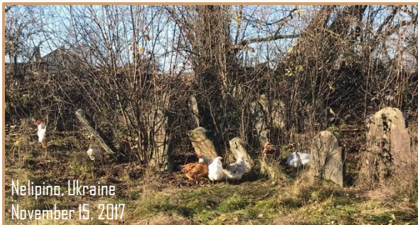
Nelipno, Ukraine November 15, 2017

The abandoned cemetery lays in ruins in a disgraceful condition. It is most urgent to have a fence built and have the tombstones restored/erected