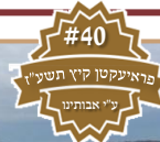
Marghita, Romania November 13, 2017