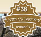
Desesti, Romania November 5, 2017