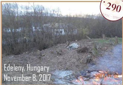
Edeleny, Hungary November 8, 2017

The cemetery, overgrown with weeds is being cleaned in preparation for construction work